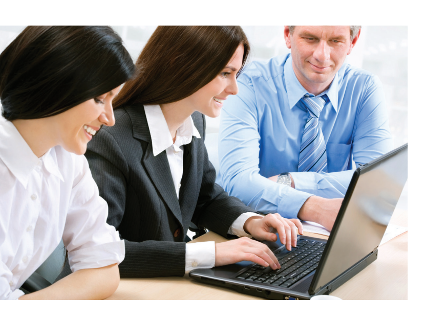
KYOCERA KX DRIVER 7.0 BRINGS EFFICIENCY AND TIME SAVING CAPABILITIES TO YOUR PRINTING.

In today's office environment, ease of use, simplicity and functionality are key. The KYOCERA KX Driver<sup>™</sup> has been long recognized for its ability to deliver on each of these requirements. Now, the redesigned Windows-compatible KX Driver version 7.0, available for all Kyocera MFPs and printers, takes the user experience to an entirely new level, bringing efficiency and time saving capabilities to your printing.